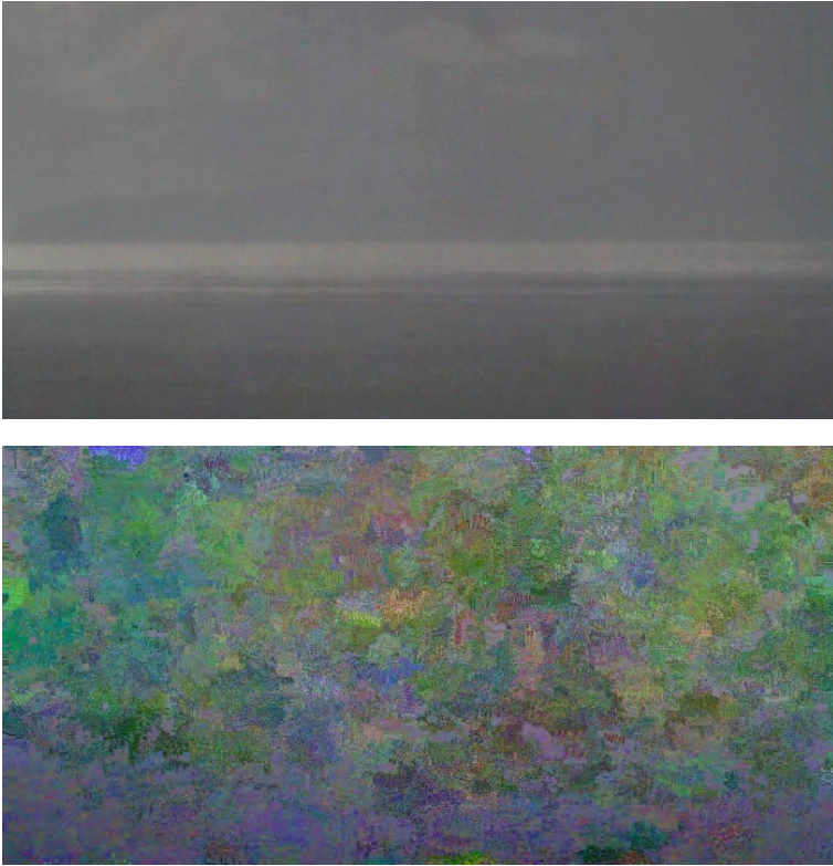
Figs 1, 2: Jacques Perconte, Chuva (Madeira) (2012), 2K Scope 24p film, courtesy of the artist.

In her How Not to Be Seen: A Fucking Didactic Educational .MOV File (2013), Steyerl develops a reflection articulated in a series of different ‘lessons’ on how to become invisible in a world which tends more and more to a condition of widespread panopticism. ‘Lesson I’ explains through a voiceover that there are ‘four ways to make something invisible for a camera’: ‘to hide’, ‘to remove’, ‘to go off screen’, ‘to disappear’, or to stay below the resolution threshold of a camera. Steyerl refers explicitly to ‘resolution targets’, the patterns drawn on the surface of the clear-skied, desert areas in order to measure the visibility of satellite cameras, and underlines the fact that the rectangular patterns used by the US Air Force in 1950s and 1960s have been replaced around 2000 with a new standard for resolution targets: a series of pixel-based resolution charts with black and white squares [Figs 3, 4]. The voiceover reminds us that ‘resolution measures visibility’, and that ‘whatever is not captured by resolution is invisible’. Given that in 1996 the resolution of a satellite camera was about 12 meters per pixel, while in 2013 it is approximately